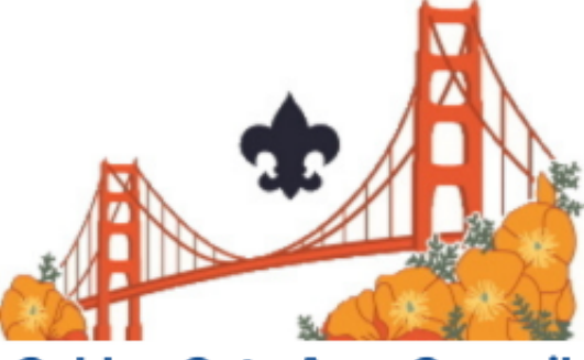
Golden Gate Area Council Scouting America