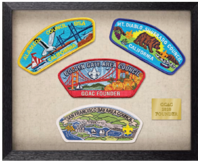
Golden Gate Area Council Founder Patch (the one in the center)

New Golden Gate Area Council patches are being produced. Keep in touch to find out when they arrive. If you want a special keepsake and have not had a chance to donate to the 2020 Friends of Scouting campaign, you may do both in the coming months. Visit the bottom of this link: https://ggacbsa.org/donate/ to donate to the 2020 GGAC Founders Campaign. A $100 donation or higher levels will help keep Scouting going in Muir District and will net you a Founder version of the Golden Gate Area Council shoulder patch. We just hit the 50% mark of our modified $23,000 FOS goal and can use some help to get closer to goal.